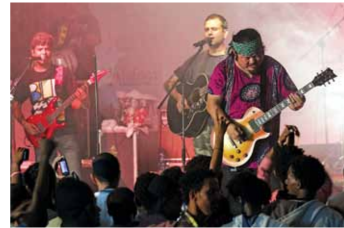
University of Addis Ababa, Ethiopia

Out of the 187 entries received, the top 18 entries won USD 1000 each. The winners were from Ghana, India, Mozambique, Tanzania, Uganda and Nigeria.