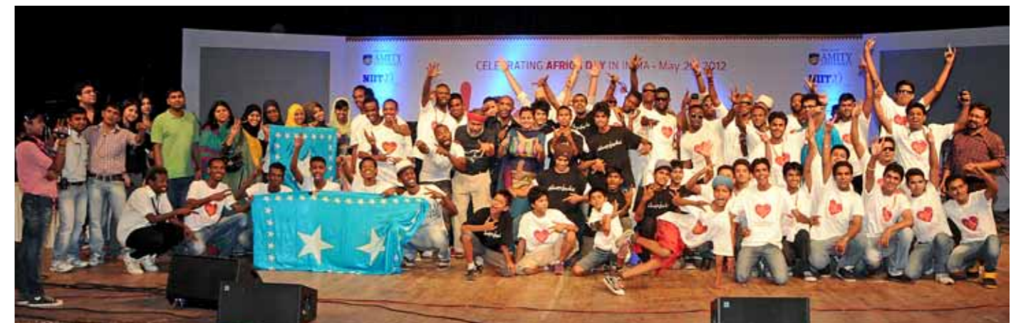
AFRICA DAY Celebrations, New Delhi