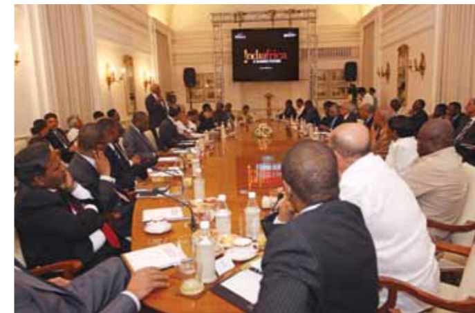
Interaction with African Heads of Mission, New Delhi