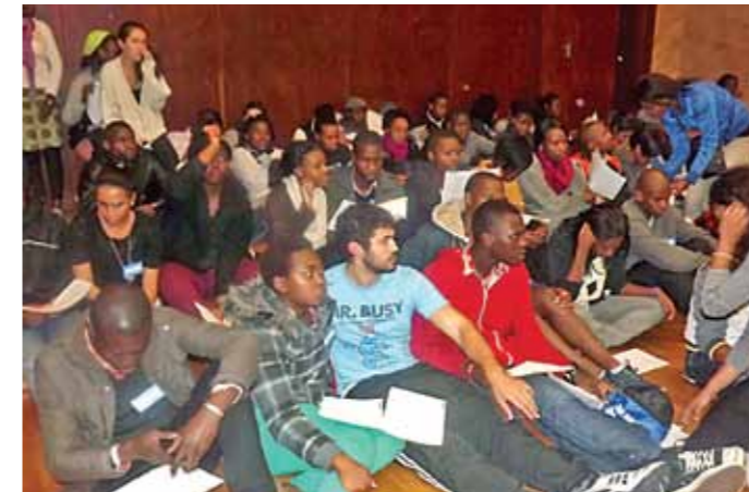
AIESEC Apprenticeship Challenge, Capetown, South Africa