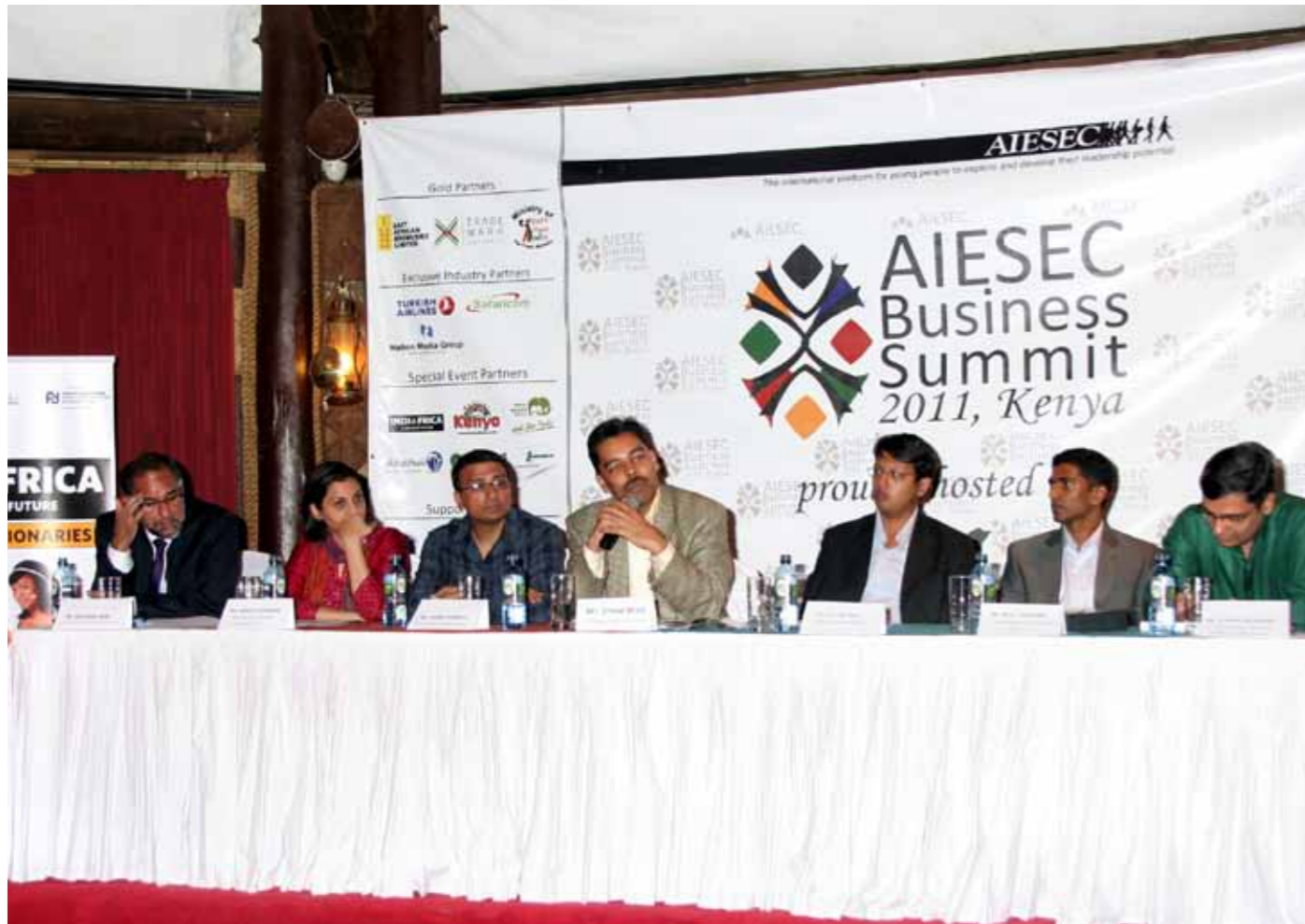
INDIAFRICA: A Shared Future launch at the AIESEC Business Summit on 26 August, 2011 in Nairobi