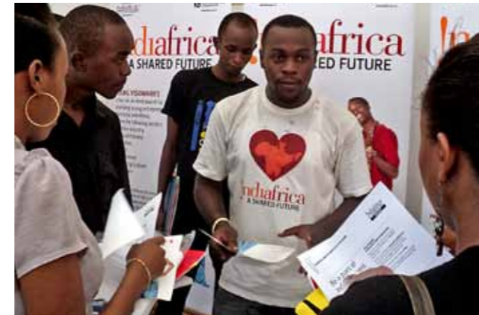
University of Dar es Salaam, Tanzania