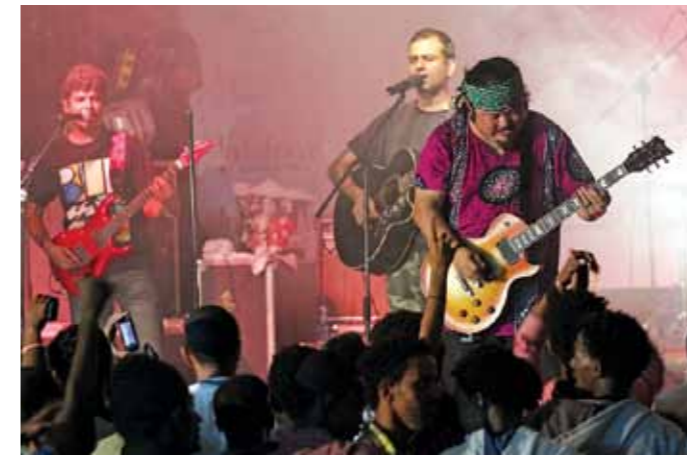
University of Addis Ababa, Ethiopia

Out of the 187 entries received, the top 18 entries won USD 1000 each. The winners were from Ghana, India, Mozambique, Tanzania, Uganda and Nigeria.